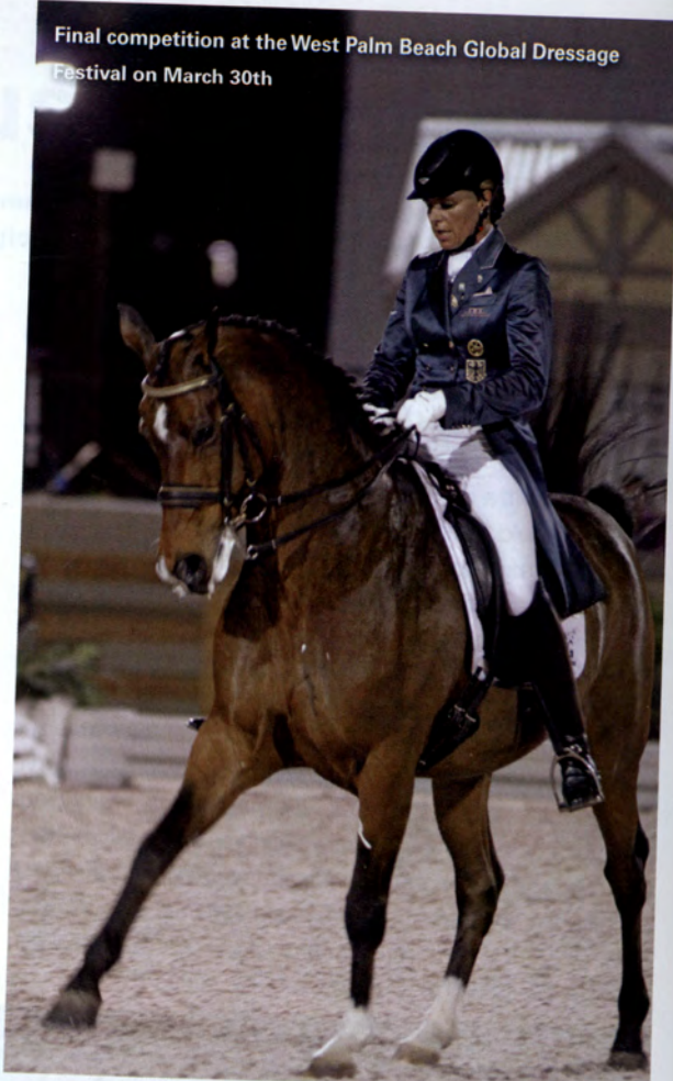
Final competition at the West Palm Beach Global Dressage Festival on March 30th